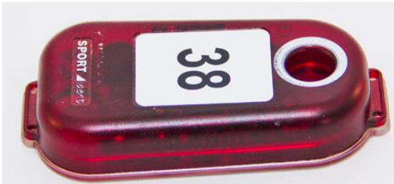
打卡器 Timing Unit