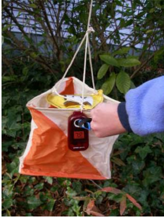
控制點標旗 Control Flag