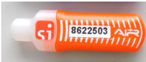
計時指卡 Timing Chip